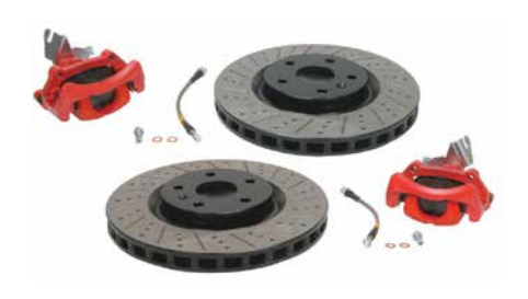
2B-9006XR 2005-14 FORD MUSTANG REAR, RIGHT & LEFT