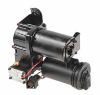
4J-1000C 2007-14 FORD EXPEDITION

Extensive performance testing including inflation time, electrical current and solenoid operation, ensures reliable performance.