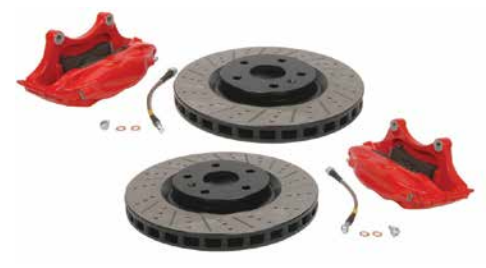
2B-9040XR 2008-14 SUBARU IMPREZA, 2015 SUBURU WRX STI FRONT, RIGHT & LEFT