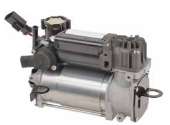
4J-2003C 2003-11 MERCEDES CLS550, CLS63, E320, E350, E550, E63