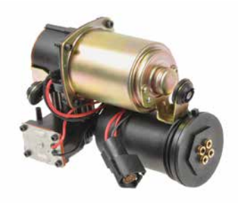
4J-1001C 1984-92 FORD LINCOLN MARK VII