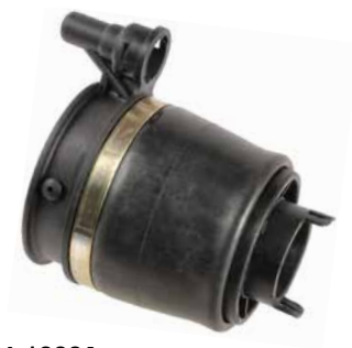
4J-1000A 2003-06 FORD EXPEDITION/ LINCOLN NAVIGATOR