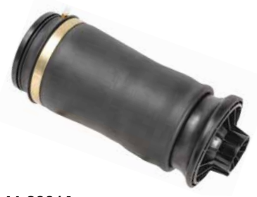
4J-2001A 2007-12 MERCEDES GL350/GL450/GL550