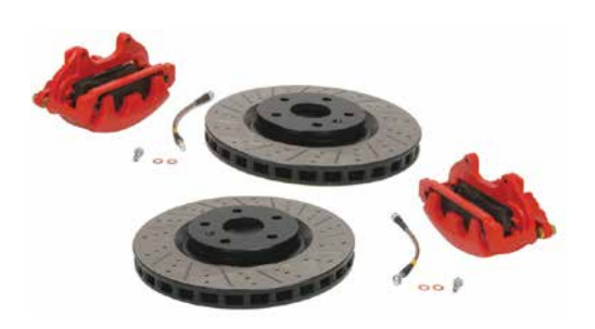
2B-9010XR 2005-11 DODGE CHARGER, 300 FRONT, RIGHT & LEFT