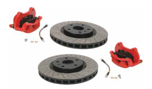
2B-9020XR 2010-13 CHEVY CAMARO, CAPRICE FRONT, RIGHT & LEFT

New semi-metallic upgraded brake pads Reman red powder-coated calipers