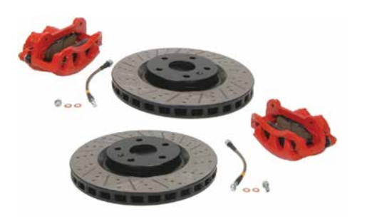
2B-9000XR 2005-10 FORD MUSTANG FRONT, RIGHT & LEFT