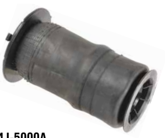
4J-5000A 2002-09 BUICK RAINIER/CHEVROLET TRAILBLAZER/ GMC ENVOY/OLDSMOBILE BRAVADA/SAAB 9-7x