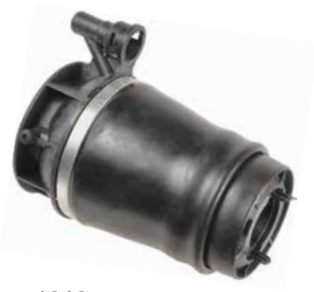
4J-1012A 2003-06 FORD EXPEDITION/ LINCOLN NAVIGATOR