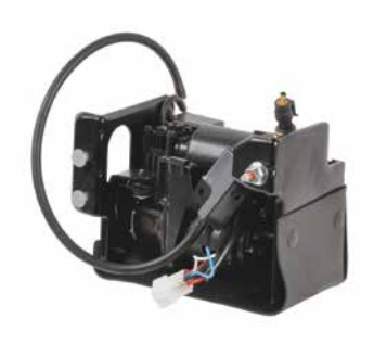
4J-0003C 2000-06 CHEVROELT SUBURBAN, TAHOE, AVALANCHE/GMC YUKON

A comfortable ride for years to come at — at a fraction of the typical market price.